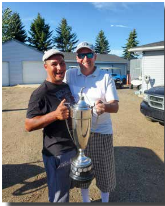
Looks like everyong wanted a piece of the Canadian Open Trophy!