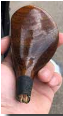
A casualty of hickory golf!